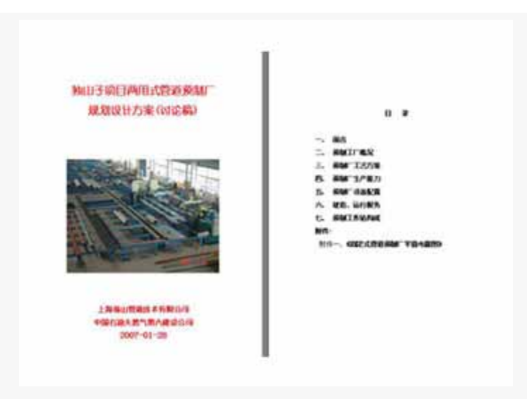
Factory Programming and Design Service